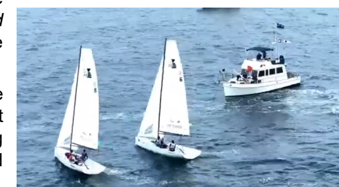
At left, 2023 GovCup TV with screen shot from one of two drones (in addition to roving boat and base boat cameras and commentators).